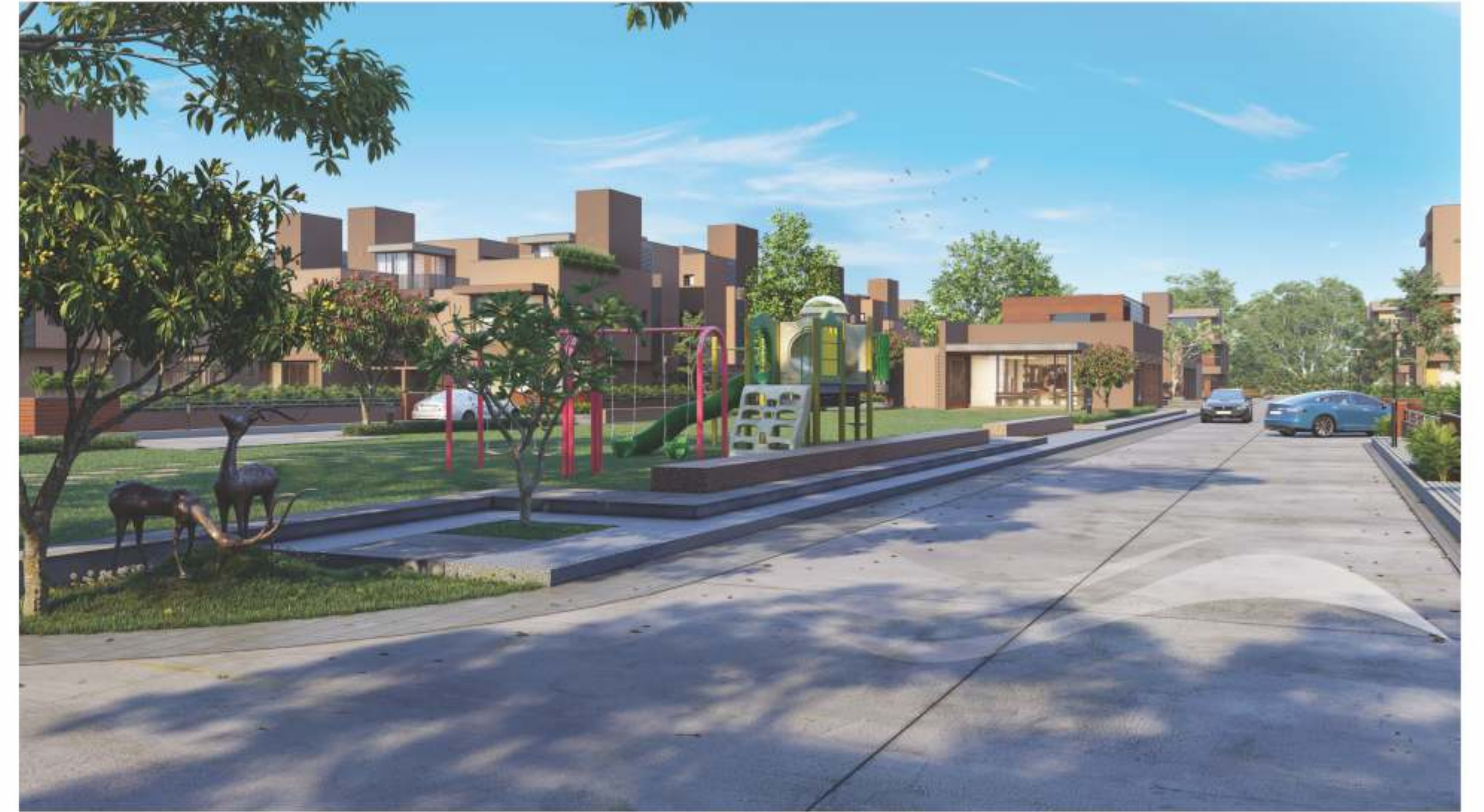
Garden Club House & Children Play area