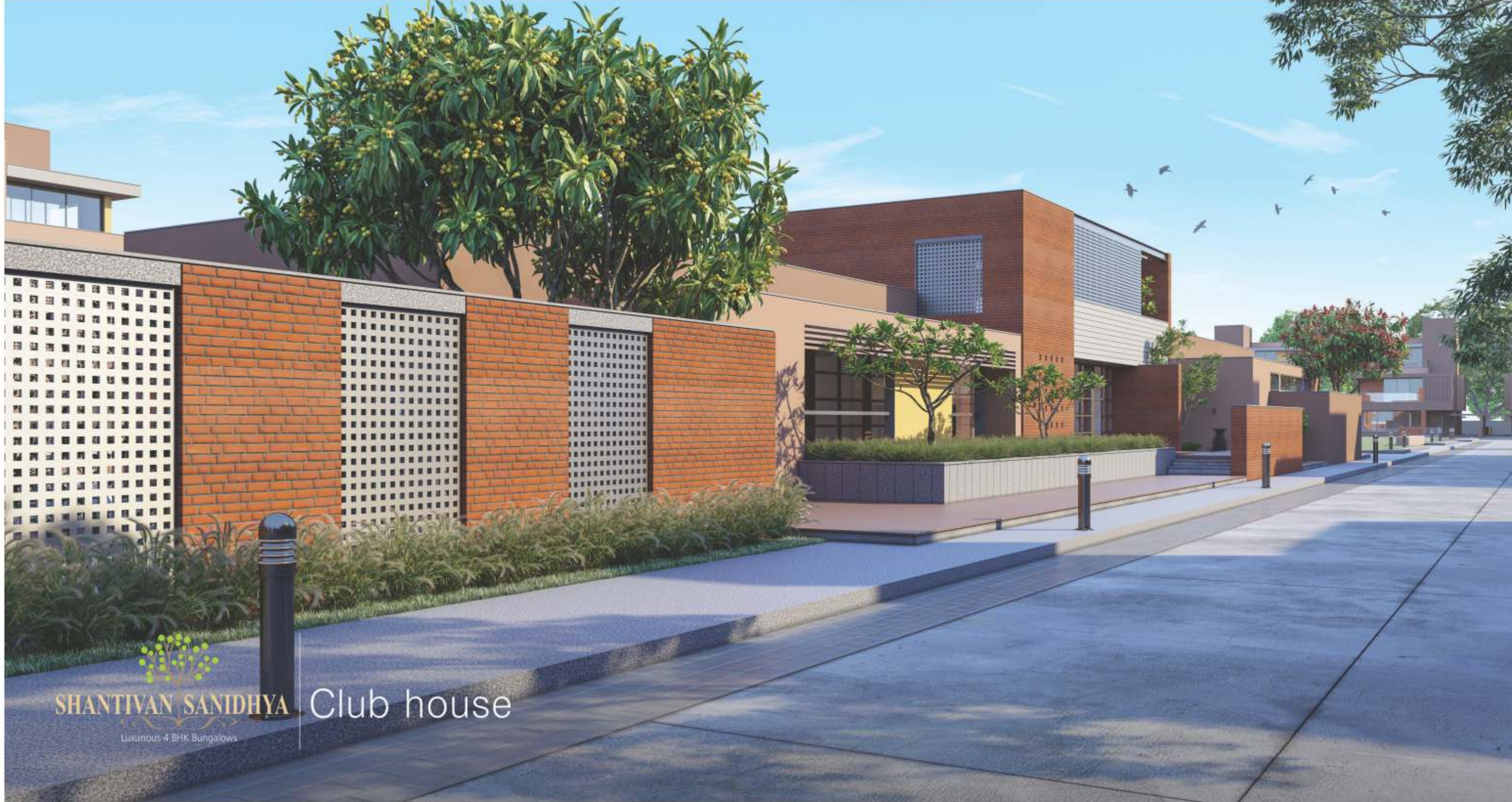
SHANTIVAN SANIDHYA Club house