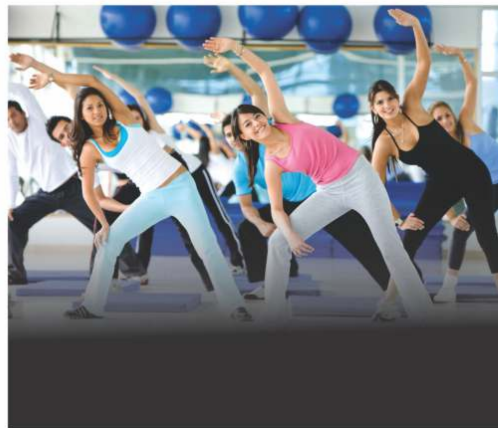
MULTI - FUNCTION / INDOOR SPORTS