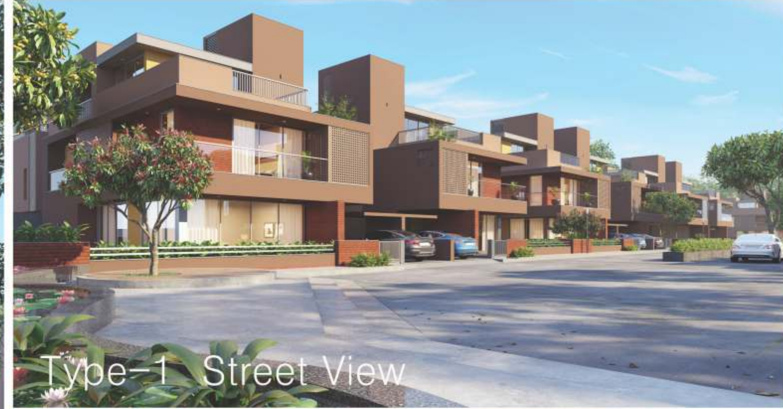
Type-1 Street View