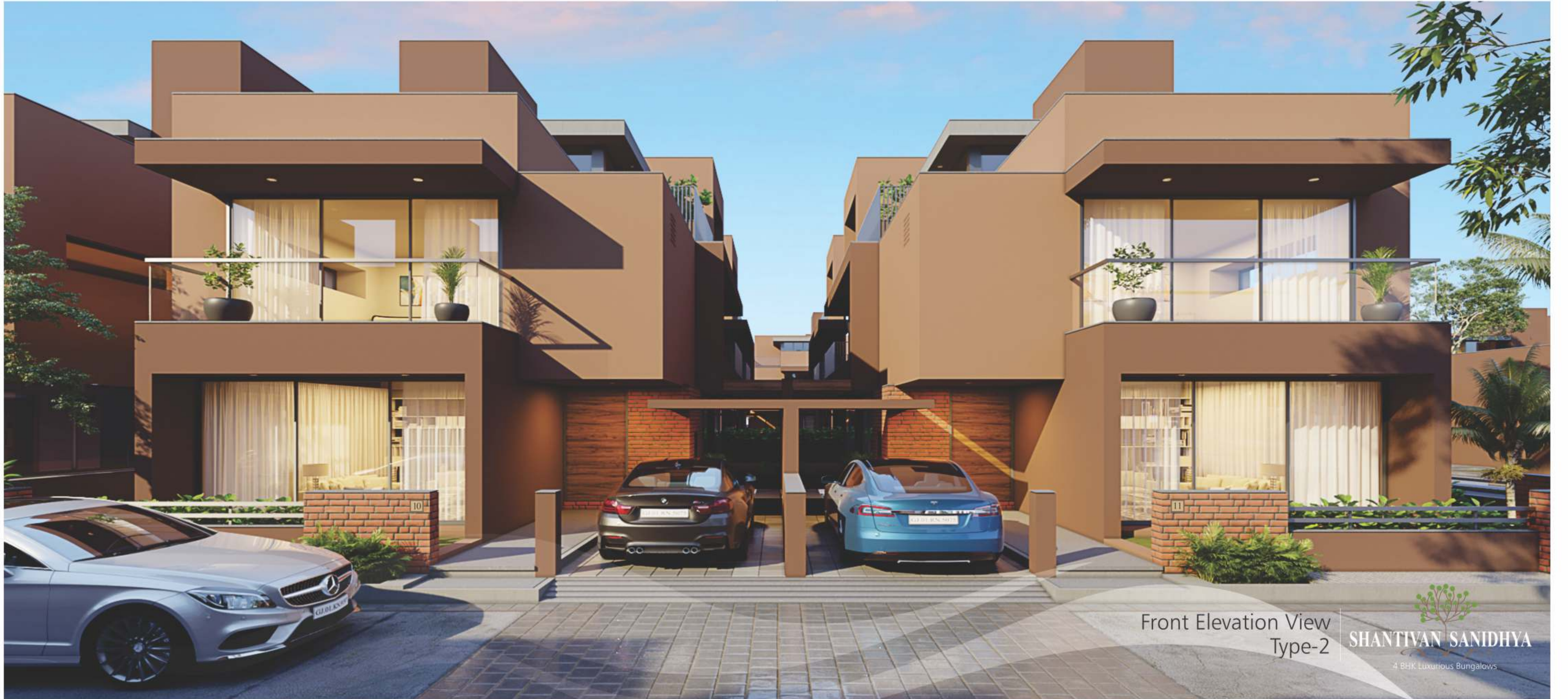
Front Elevation View Type-2