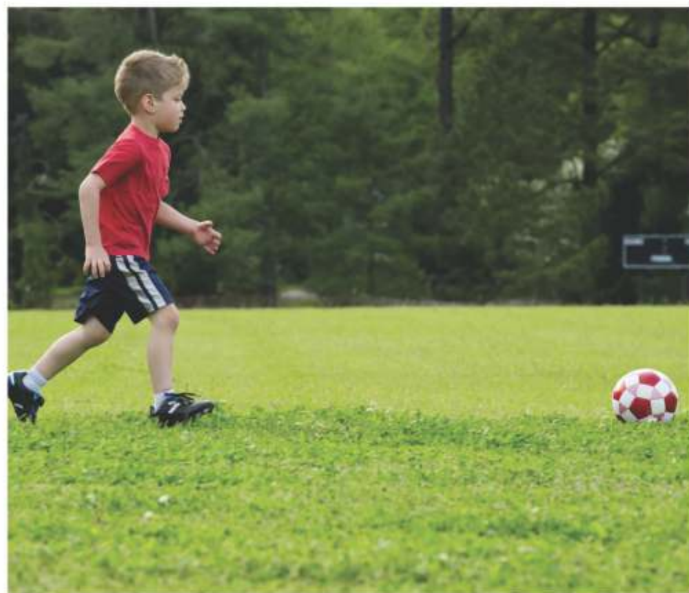
CHILDREN PLAY & SINNER CITIZEN SITTING AREA